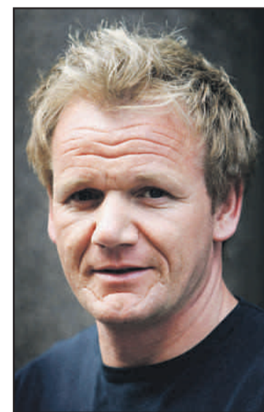
Pub grub: The Narrow will be Gordon Ramsay's first pub.